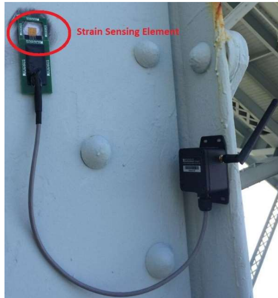
Figure 2: SenSpot™ steel strain gauge installed on a bridge web

Following table provides an easy step by step guide for installing SenSpot™ steel strain gauge to a bridge.