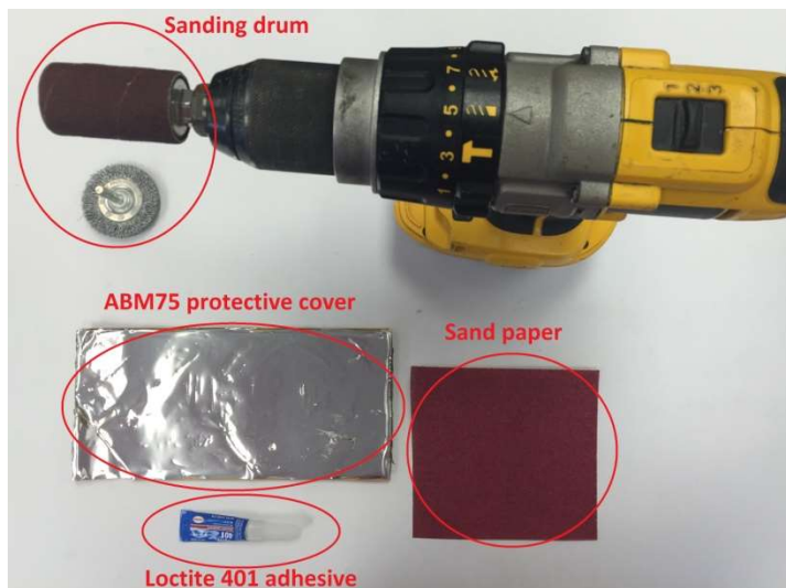
Figure 1: Tools required for installing SenSpot™ steel strain gauge

Typically, cold cured adhesive and ABM75 protective cover are provided by Resensys to the customer along with SenSpot™ steel strain gauge. Other items such as sanding drum and drill or sand paper and wiping tissues can be purchased from any local hardware store.